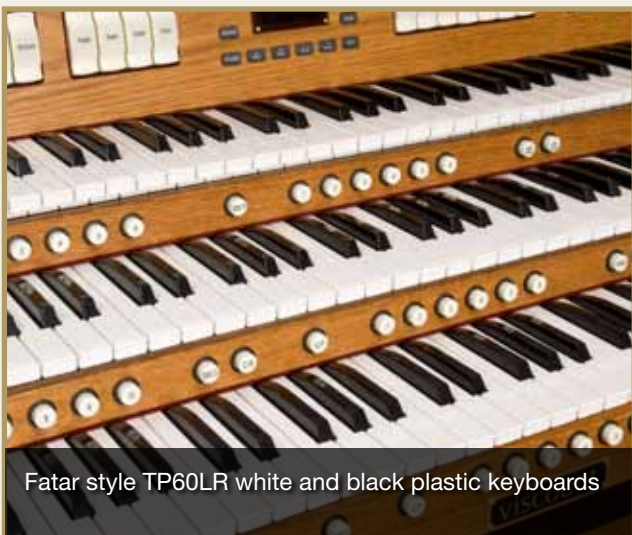
Fatar style TP60LR white and black plastic keyboards