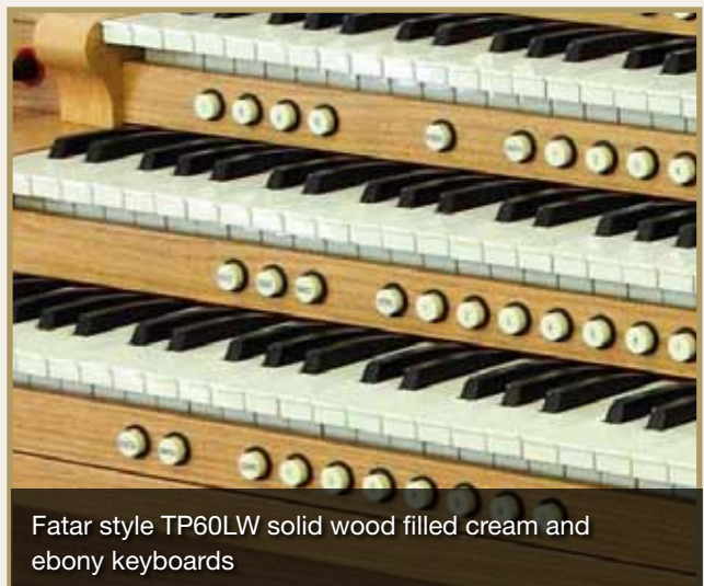
Fatar style TP60LW solid wood filled cream and ebony keyboards